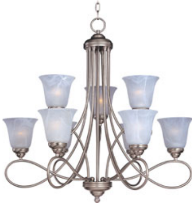
11046MRSN Nova 9-Light Chandelier