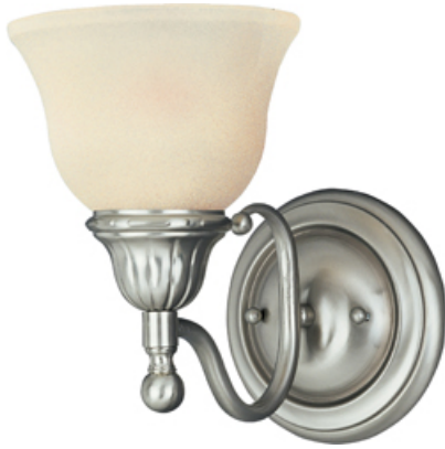
11056SVSN Soho 1-Light Wall Sconce