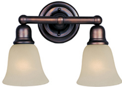
11087SVOI Bel Air 2-Light Bath Vanity