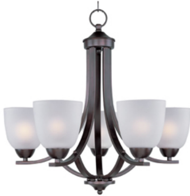
11225FTOI Axis 5-Light Chandelier