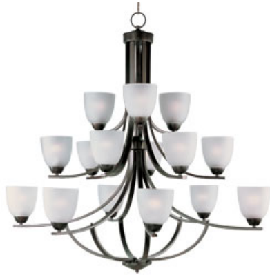
11228FTOI Axis 15-Light Chandelier