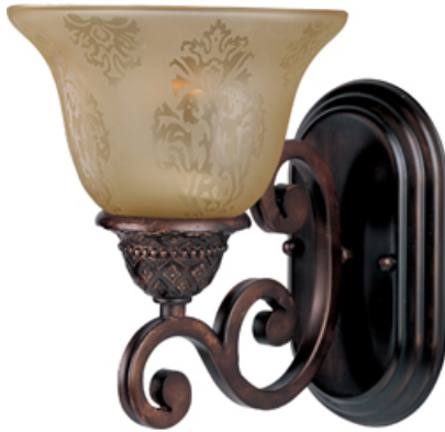
11230SAOI Symphony 1-Light Wall Sconce