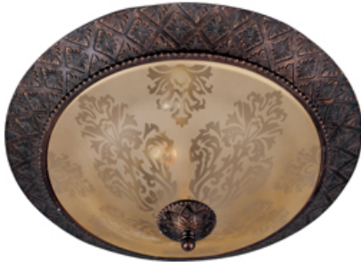
11240SAOI Symphony 2-Light Flush Mount