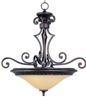
11242SVOI Symphony 3-Light Invert Bowl Pendant