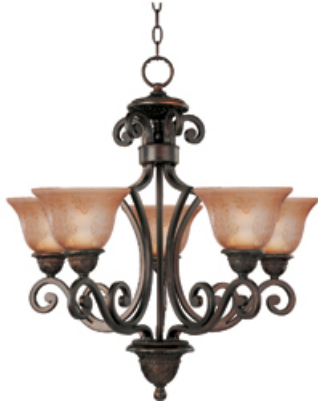
11244SAOI Symphony 5-Light Chandelier