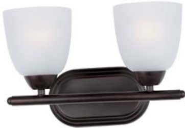
11312FTOI Axis 2-Light Bath Vanity