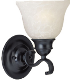
11807ICBK Linda 1-Light Wall Sconce