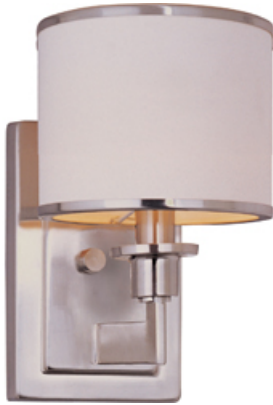
12059WTSN Nexus 1-Light Wall Sconce