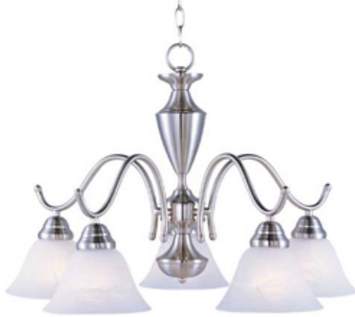
12062MRSN Newport 5-Light Chandelier