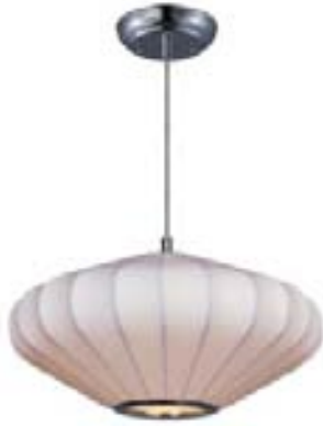
12185WTPC Cocoon 1-Light Pendant