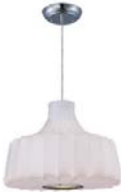
12186WTPC Cocoon 1-Light Pendant