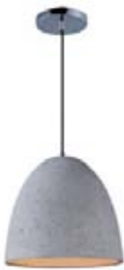
12396GYPC Crete 1-Light Pendant