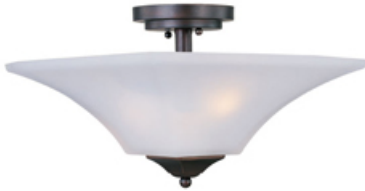
20091FTOI Aurora 2-Light Semi-Flush Mount