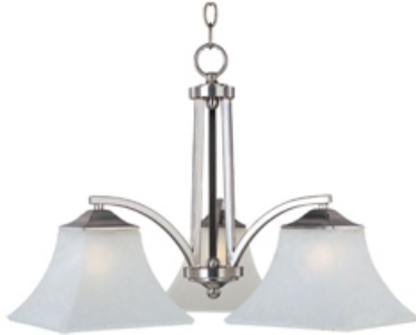
20094FTSN Aurora 3-Light Chandelier