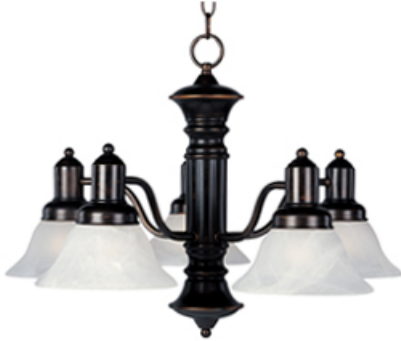
20325MROI Newburg 5-Light Chandelier