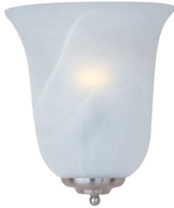
20581MRSN Essentials 1-Light Wall Sconce