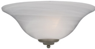
20582MRPE Essentials 1-Light Wall Sconce