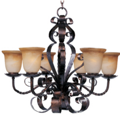
20607VAOI Aspen 6-Light Chandelier