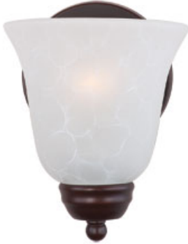
2120ICOI Basix 1-Light Wall Sconce