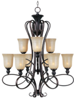
21306WSOI Infinity 9-Light Chandelier