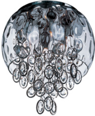
21470WGPN Ripple 6-Light Flush Mount