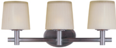
21513DWOI Finesse 3-Light Bath Vanity