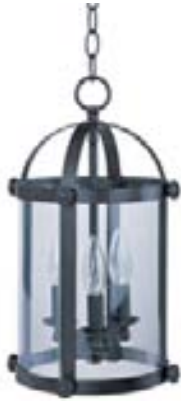
21552CLBZ Tara 3-Light Pendant