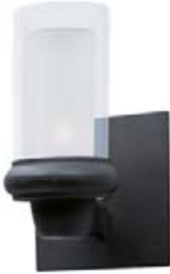
22351CLFTBZ Bayview 1-Light Wall Sconce