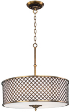
22364OMNAB Manchester 6-Light Pendant