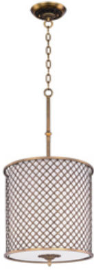
22367OMNAB Manchester 4-Light Pendant