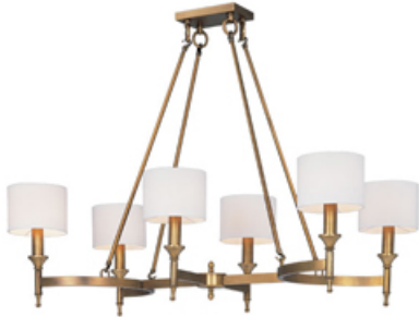
22376OMNAB Fairmont 6-Light Chandelier