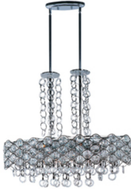
23097BCPC Cirque 12-Light Chandelier