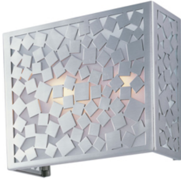
24339FTSN Matrix 2-Light Wall Sconce