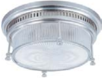
25000CLSN Hi-Bay 2-Light Flush Mount