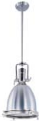
25104FTPN Hi-Bay 1-Light Pendant