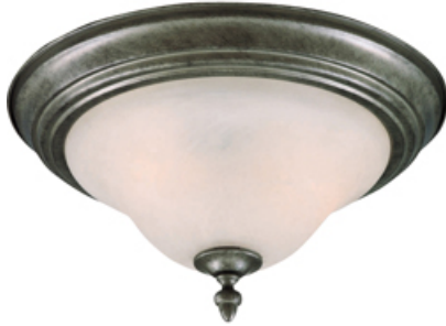
2650MRPE Pacific 2-Light Flush Mount