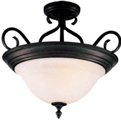
2652MRKB Pacific 3-Light Semi-Flush Mount