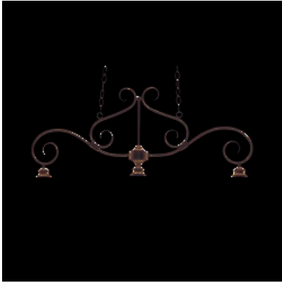
2653MRKB Pacific 3-Light Pendant