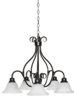
2657MRKB Pacific 5-Light Chandelier