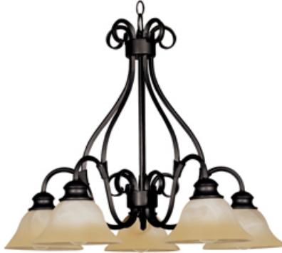
2657WSKB Pacific 5-Light Chandelier