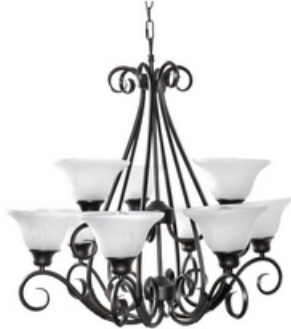
2658MRKB Pacific 9-Light Chandelier