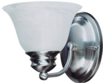
2686FTSN Malaga 1-Light Wall Sconce