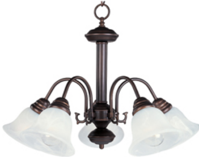
2698MROI Malaga 5-Light Chandelier