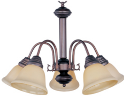
2698WSOI Malaga 5-Light Chandelier