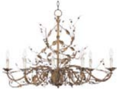
2860EG Elegante 8-Light Oval Pendant