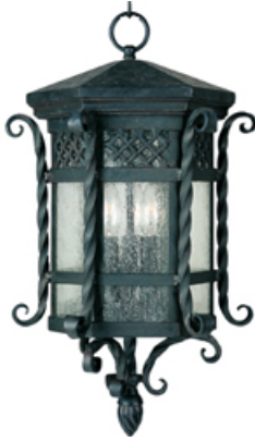
30128CDCF Scottsdale 3-Light Outdoor Hanging Lantern