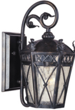
30454CDAT Canterbury 1-Light Outdoor Wall Lantern