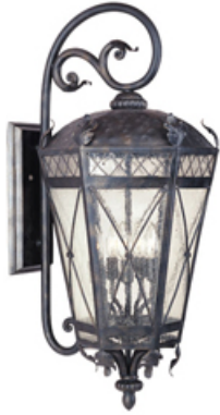
30456CDAT Canterbury 3-Light Outdoor Wall Lantern