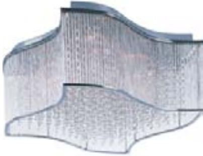
39701CLPC Swizzle 20-Light Flush Mount