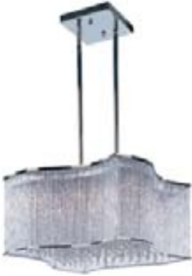
39705CLPC Swizzle 20-Light Pendant